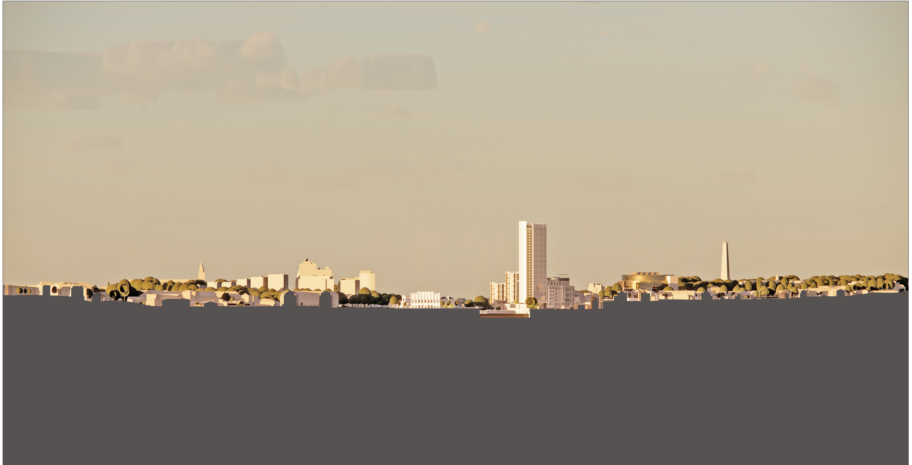
CROSS SECTION THROUGH THE RIVER LIFFEY