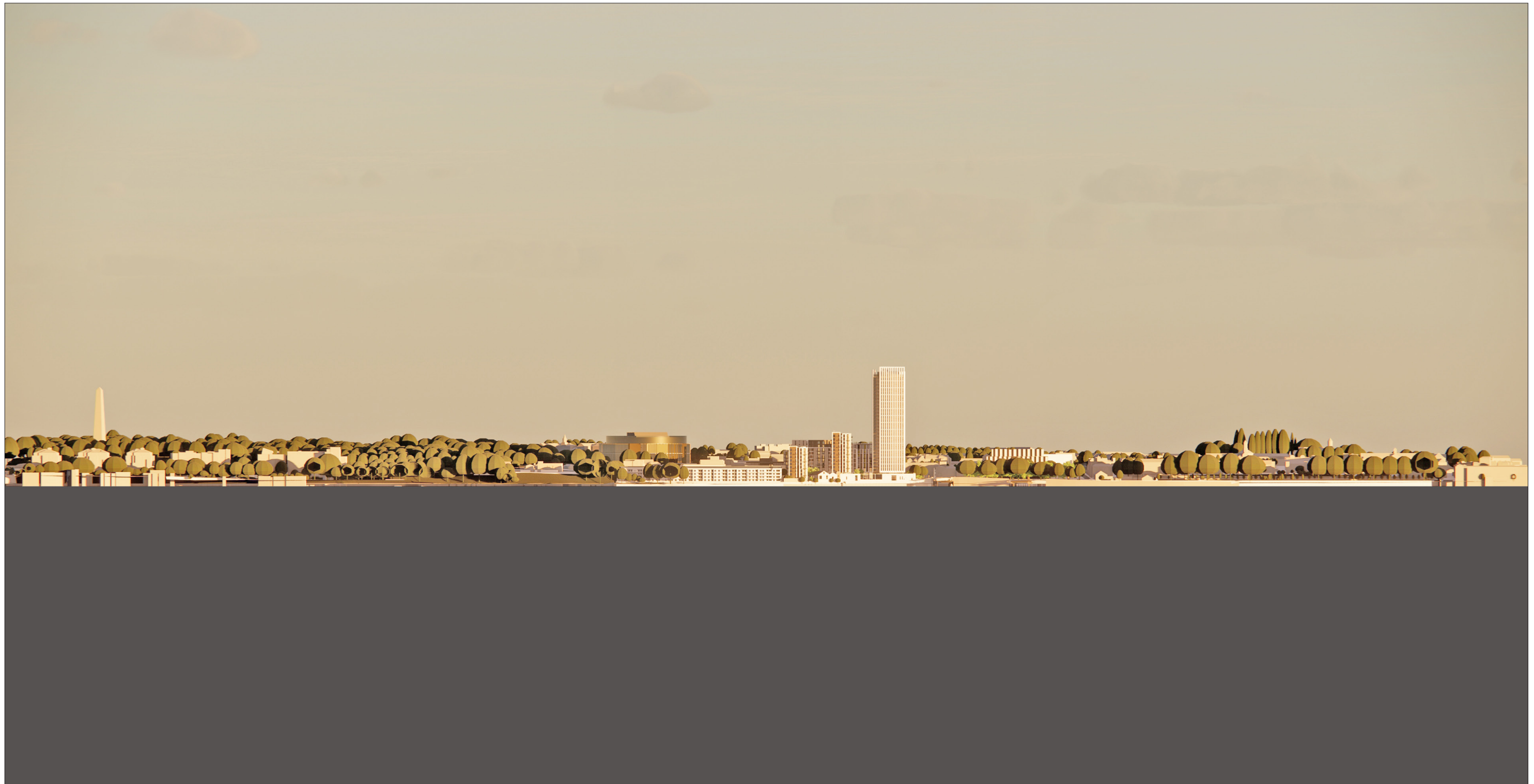
LONG SECTION THROUGH THE RIVER LIFFEY