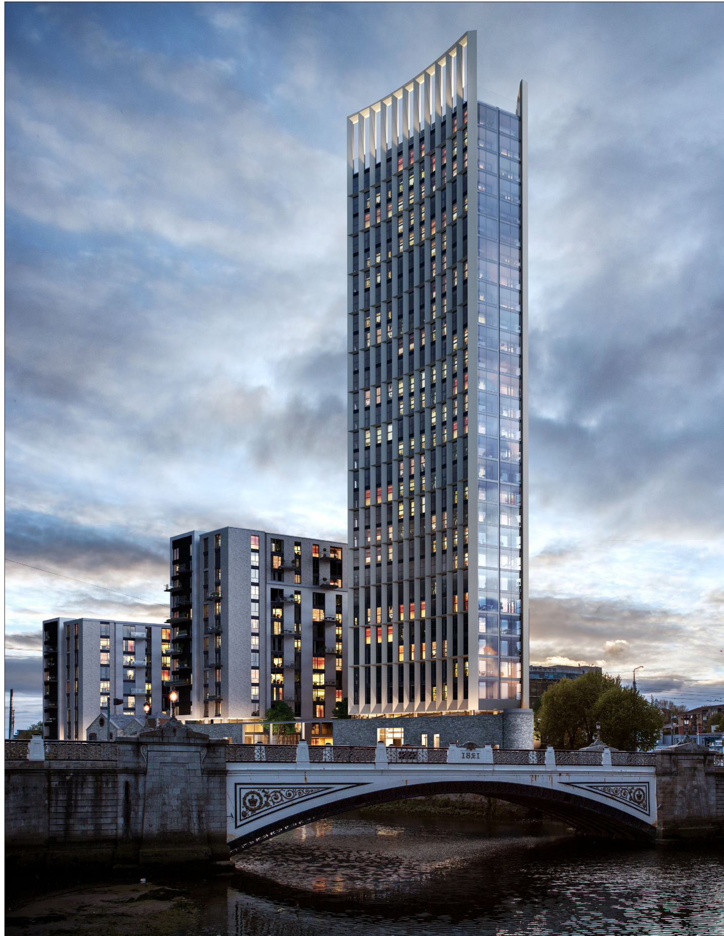
COMPUTER GENERATED IMAGE OF THE PROPOSED DEVELOPMENT • DUSK Seen in the context of the approved parts of the 42A Parkgate Street Scheme