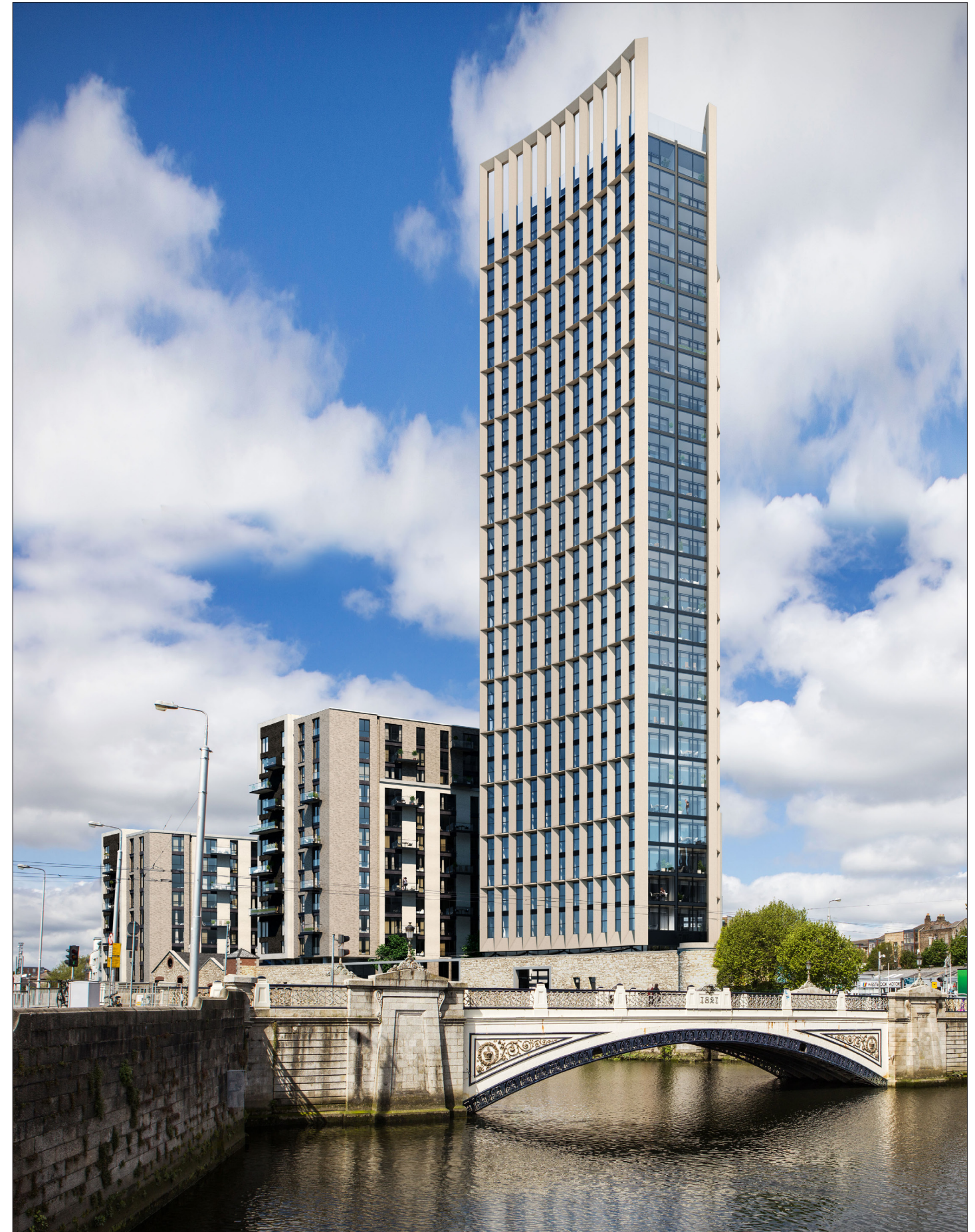
COMPUTER GENERATED IMAGE OF THE PROPOSED DEVELOPMENT • DAYTIME Seen in the context of the approved parts of the 42A Parkgate Street Scheme