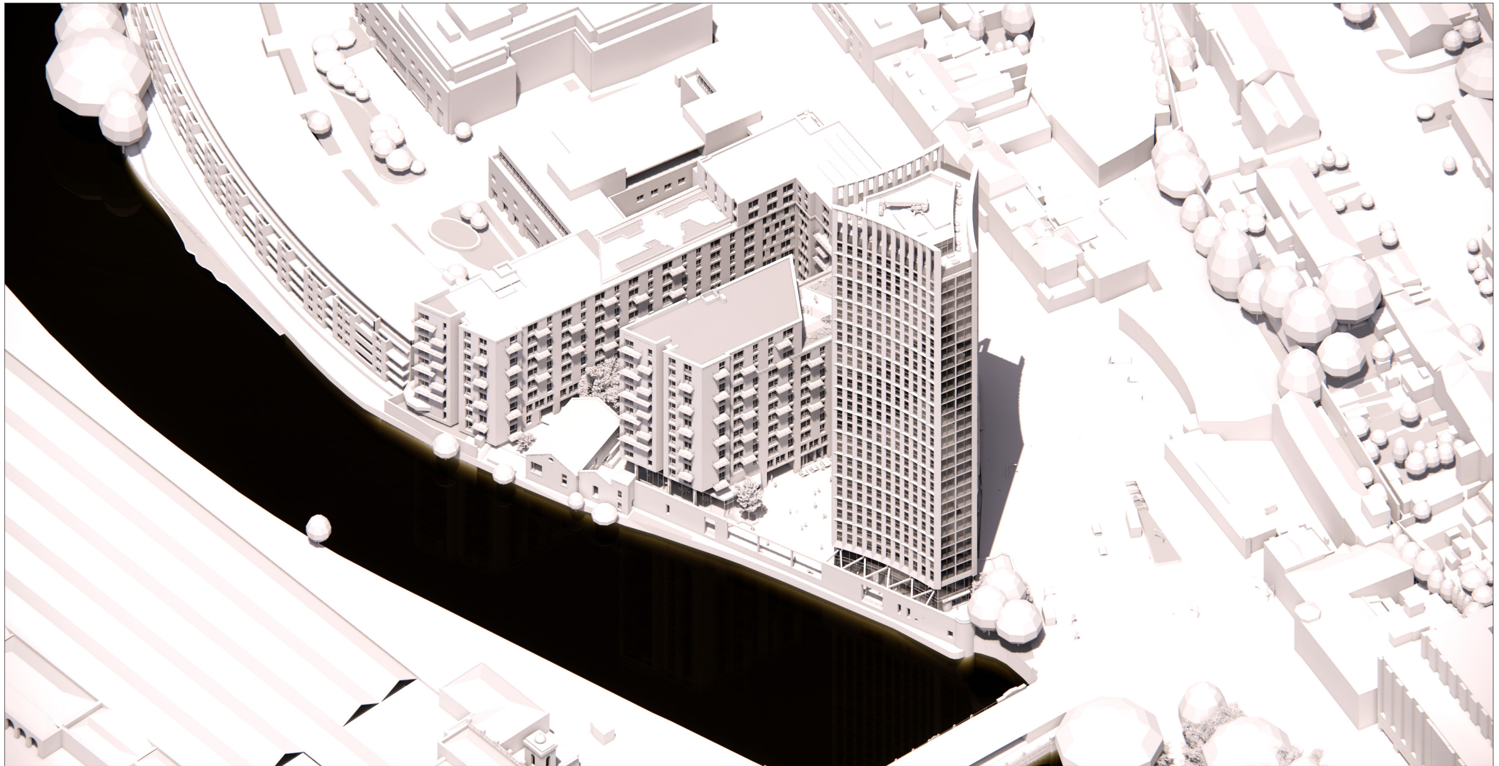
AXONOMETRIC VIEW FROM THE SOUTH EAST