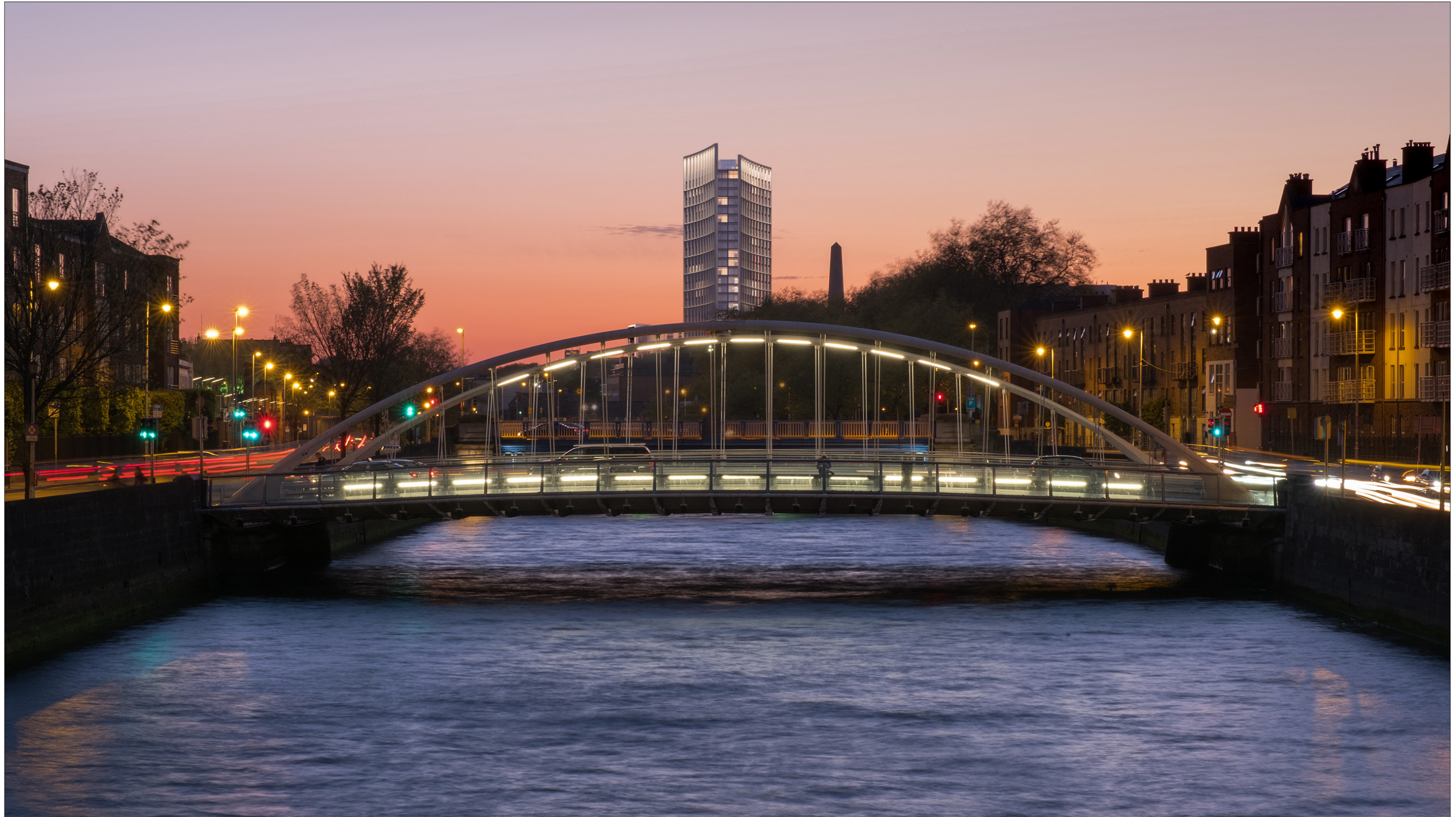
COMPUTER GENERATED IMAGE OF THE PROPOSED DEVELOPMENT • DUSK Seen behind the James Joyce Bridge